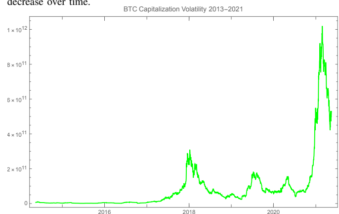
Fig. 2. Too volatile to fail? We show the volatility of the capitalization of BTC. At higher levels of capitalization, return volatility compounds. In 2021 a swing of half a trillion dollars in the capitalization of bitcoin took place.

[2]. Indexing sequences by t = 1, 2, \dots, n , with a seed at t , a variable x_t on the real line generates via nonlinear transformations r : \mathbb{R} \rightarrow \mathbb{R} , an output variable r(x_t) . This output variable can serve as a pseudorandom seed to generate another pseudorandom variable, r(x_{t+1}) . For all t , knowledge of r(x_t) allows knowledge of all subsequent variables r(x_\tau)_{\tau > t} and replication of the entire sequence, thus probabilistically mimicking the arrow of time. It is also crucial that the same seed produces exactly the same pseudorandom variable, allowing verification of sequence, but disallowing easy reverse engineering.